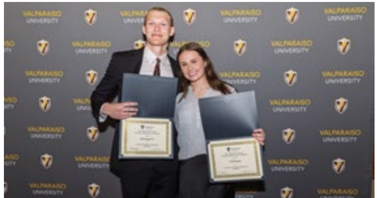
Phi Psi and Chi Omega, received the Excellence in Chapter Management Award, recognizing their strong organizational leadership and chapter operations.